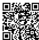
Zoom Link Virtual Prayer