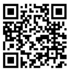
New Visitor Sign-up Form